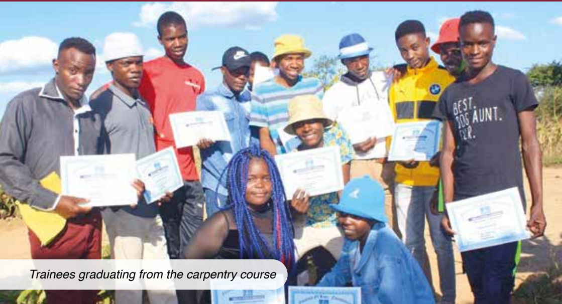
Trainees graduating from the carpentry course

Zimbabwe is a country in crisis with devastating economic fall-out from Covid, soaring fuel prices, crippling levels of unemployment and widespread hunger due to the lack of basic food crops and the war in Ukraine. And without the Government support that has been promised.