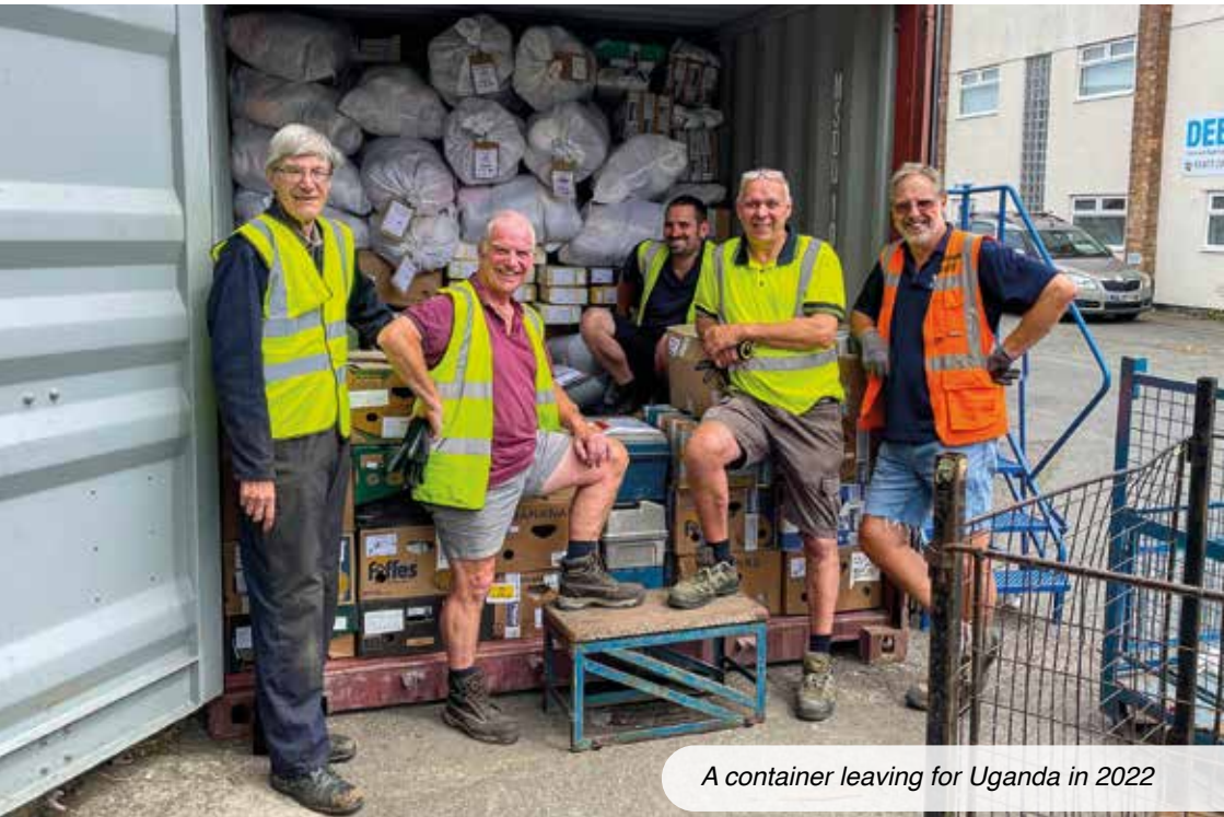
A container leaving for Uganda in 2022

But what is the answer? Well, put very simply, it is to help people lift themselves out of ultra-poverty. This, in turn, gives families the income to send their children to school; to feed themselves every day; to buy medicine; drink clean water; keep a roof over their heads; and empower women in abusive or submissive relationships.