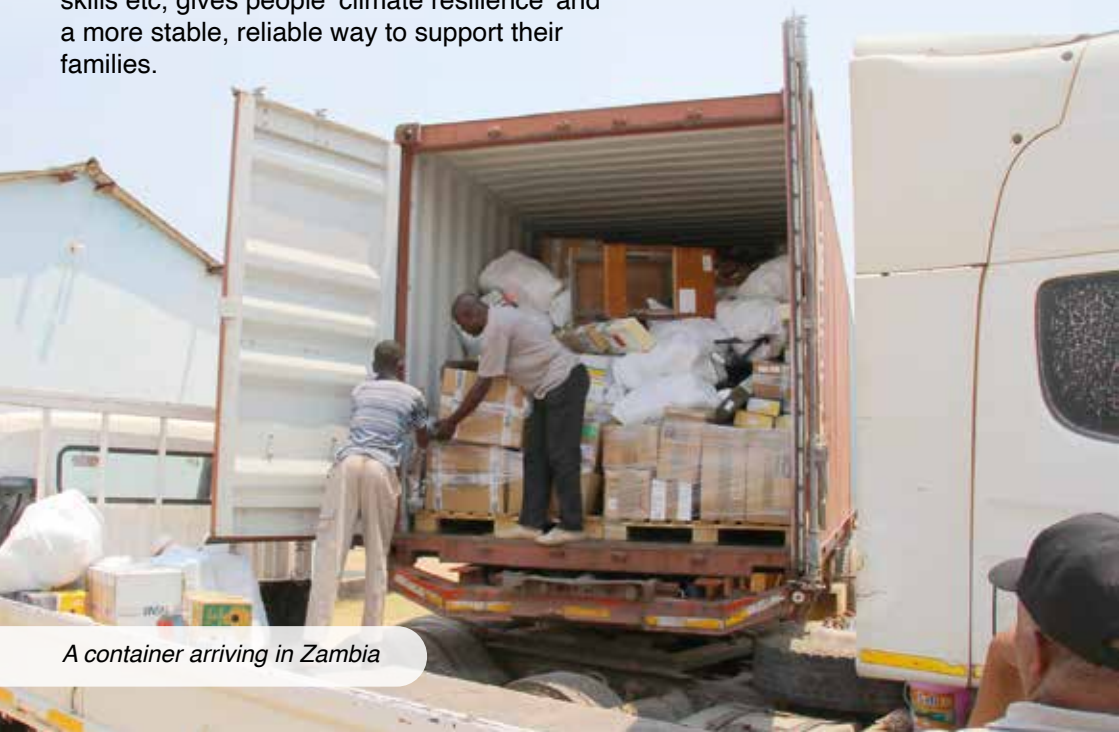
A container arriving in Zambia

Many communities recognise the support of orphans and vulnerable children as a priority and so most of the skills centres we equip are set up to meet this need. We hear inspiring stories of children rescued from street gangs, sex-work and homelessness through the offer of skills training and a future. Crucially, churches and community groups recognise it is not enough to tell people they should not be living like this; they also have to offer an alternative to survive and improve.