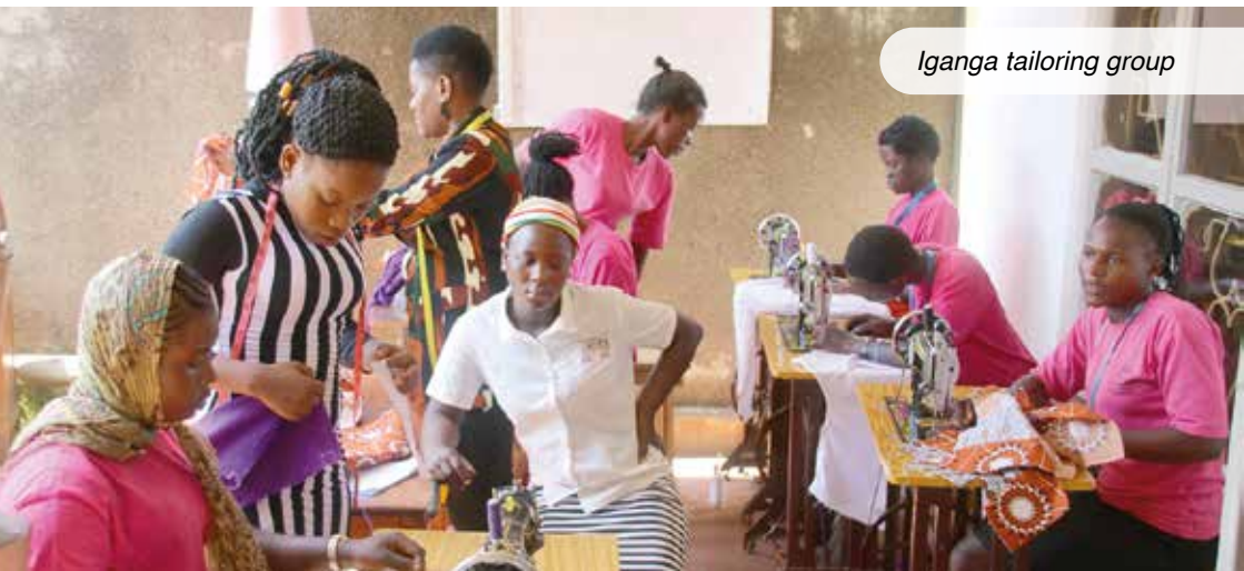
Iganga tailoring group

“Most of our students are girls, as the most vulnerable, because many are orphans or school dropouts. They are desperate and are often forced into early marriage with an older man and become teenage mothers in and out of marriage. They do this, as they do not see they have any choices. Girls have few rights and cannot inherit and are seen as second-rate and personal property. We want to help them get a skill and work that will enable them to protect themselves.”