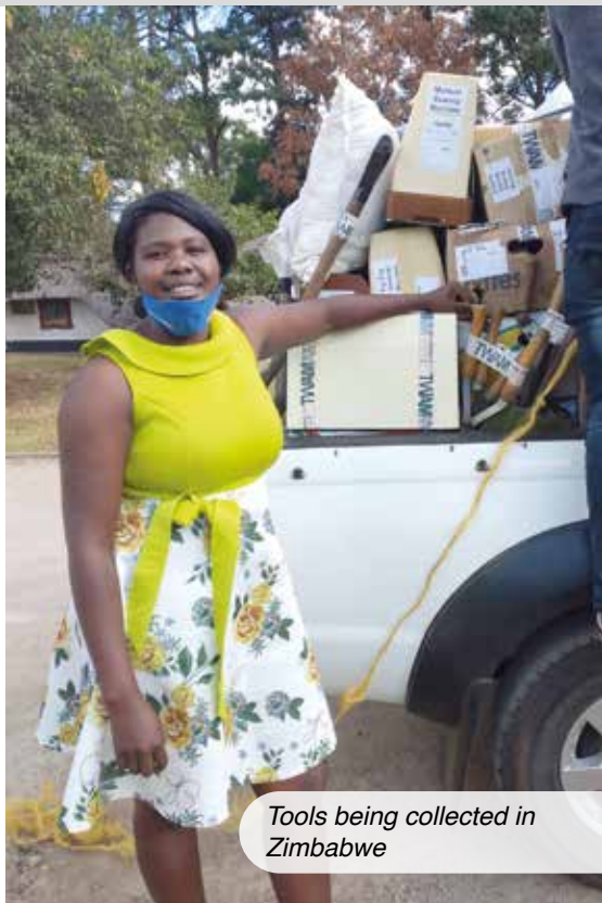
Tools being collected in Zimbabwe

Thank you for your support through these ever more challenging times.