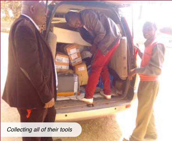
Collecting all of their tools

had no money to support them, but we knew we had to do something to help this desperate need. This made the Church Board start to think 'outside of the box' and when we came across TWAM - we saw it as our only hope."