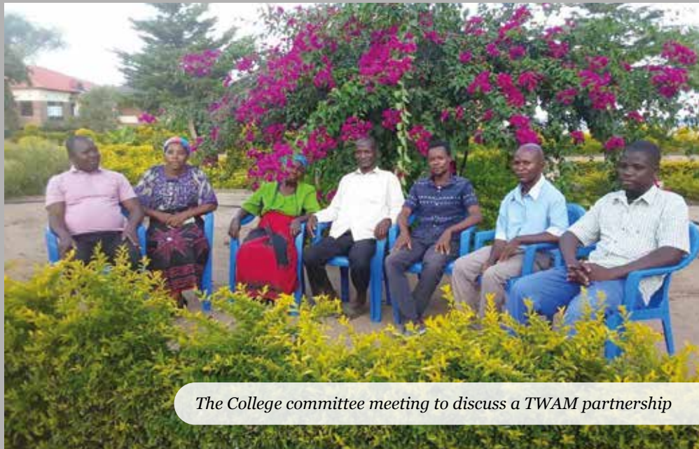
The College committee meeting to discuss a TWAM partnership

Your donated tools and your financial support transform lives. We know it's true; they know it's true; and we really hope that you know it's true too!