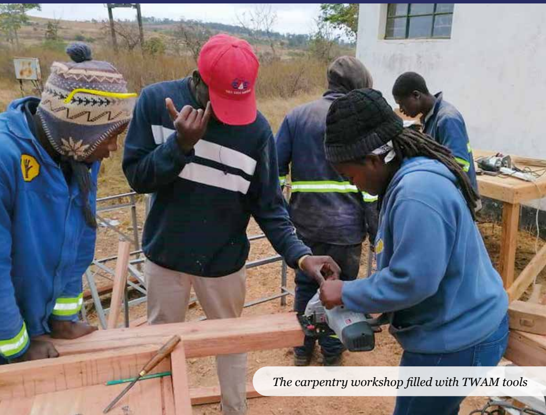
The carpentry workshop filled with TWAM tools

We might ask ourselves if such devastating and overwhelming community problems can be addressed just with training and tools? Wallace thinks they can; he continues: