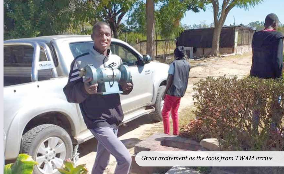
Great excitement as the tools from TWAM arrive

TWAM is grateful to the Aall Foundation for their long-term generous support of our work.